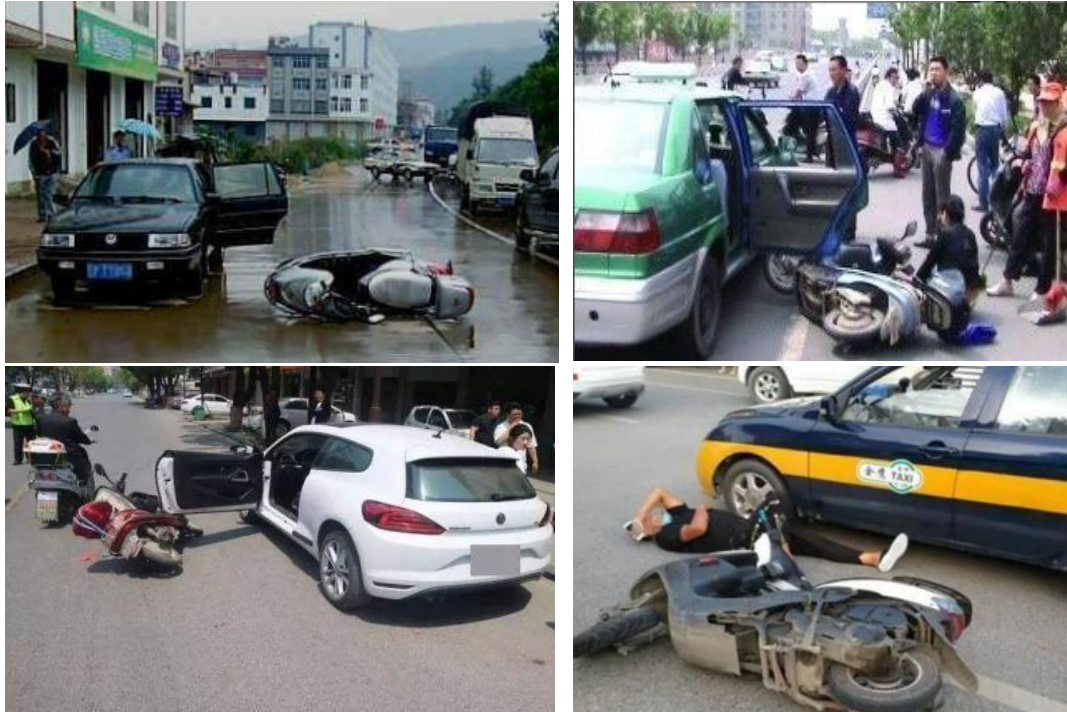
Figure 1. Car parking door accident

drove the electric bicycle from north to south. The two cars collided, and Yang fell to the ground and died after being rescued by the hospital.